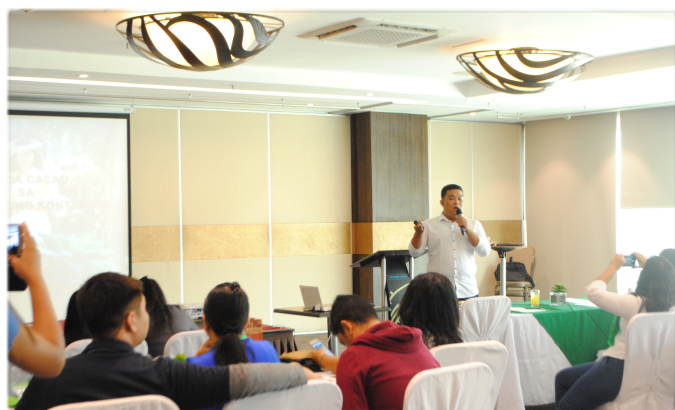
Paper Presentation: LIRIP 2017