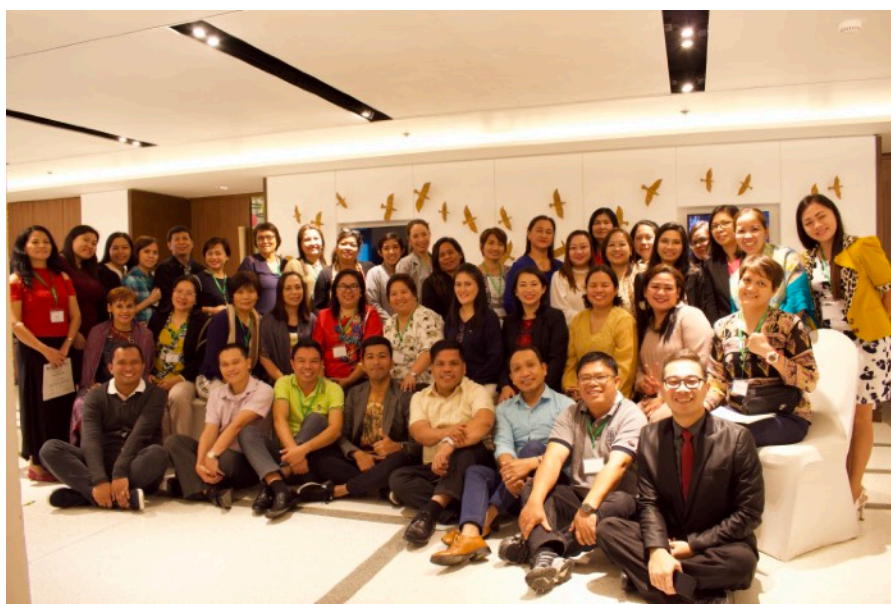
Research scholars at the 2nd "Lirip: Pambansang Kumperensiya sa Filipino" last Oct 28-30, 2018 at Hue Hotel, Puerto Princesa, Palawan.

NPRE is duly registered at the Philippine Securities and Exchange Commission bearing registration number CN201711870.